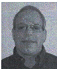
Stephill Associates, LLC