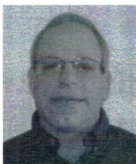
Stephill Associates, LLC